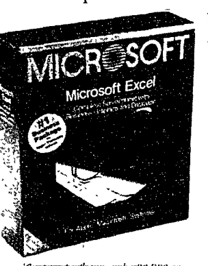
Compare textlorus similar PC TRIS or MS DOS program Excel is serious softu are for Serious business users Personal Computing

Yet you don't have to memorize complex commands to