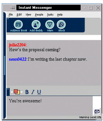
AOL Instant Messenger running on Linux with a XUL user interface enabled by Netscape Gecko.

AOL will also use Netscape Gecko to bring Web browsing to television for millions of consumers. AOL TV uses Netscape Navigator today as the basis for its television-optimized TV Navigator services platform (provided by Liberate Technologies), allowing AOL TV to deliver a Web experience as rich as the one available on PCs. Ultimately, Netscape Gecko Technologies will enable AOL TV to provide next-generation Web applications and content, taking advantage of XML to deliver improved interfaces and better performance.