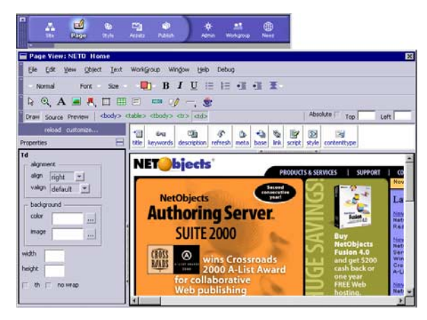
WSIYWYG content using the Netscape Gecko-equipped Integrated Application Environment.

NetObjects to extend the functionality available in Gecko. The ready availability of plug-in