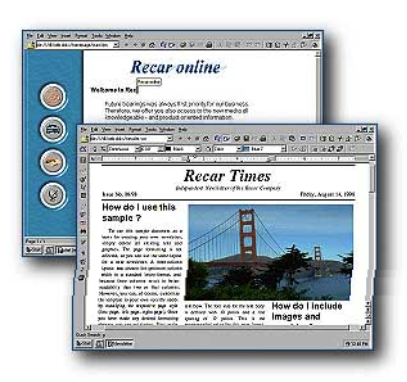
Netscape Gecko Technologies will enable StarOffice documents to display Web content.

Sun is working with mozilla.org to add technologies to Netscape Gecko that allow it to integrate with any pluggable Java runtime engine through the Open Java Interface. This will enable users to select the Java runtime engine that is best suited to their needs. Further, Sun has created a Java wrapper API that will make it easy to integrate the Netscape Gecko browser engine into any Java application and an API that will enable Netscape plug-ins to be written in the Java programming language. This addition of Java technologies to Netscape Gecko provides a powerful combination to deliver both web applications and Java applications across a variety of enterprise desktop platforms.