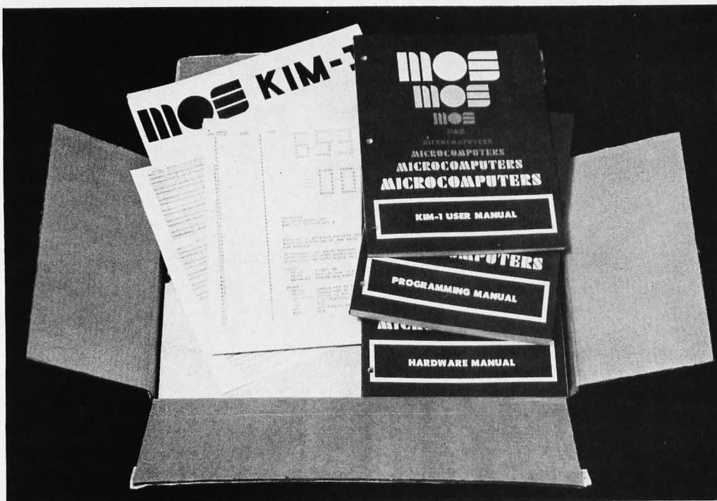
Photo 1: When you first open your KIM-1 box, you see a thick layer of documentation, including a large wall chart of the system's hardware details, an MCS650X Instruction Set Summary card, KIM-1 User Manual, Programming Manual and Hardware Manual. Also shown in this picture is the KIM monitor listing copy which must be requested separately and is a must if you are to take advantage of KIM's sub-routines in applications programs.