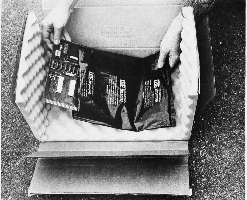
Photo 2: The KIM-1 processor as it is removed from its box. The MOS Technology product comes in a neat package which has one foam padded and static protected KIM-1 board as its bottom layer.

nology should know about such things, since they are a major manufacturer of chips for calculators).