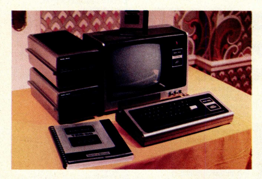
Photo 1: The New Radio Shack TRS-80 home computer system. Shown are the keyboard, video display monitor, instruction manual and prototypes of the upcoming memory expansion module and disk drive.