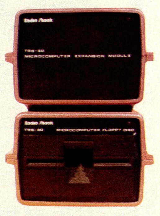
Photo 4: A closeup of the forthcoming microcomputer expansion module and disk drive.

The unit is priced competitively with some other computers on the market, and it will be interesting to see what develops in this low priced appliance computer market.