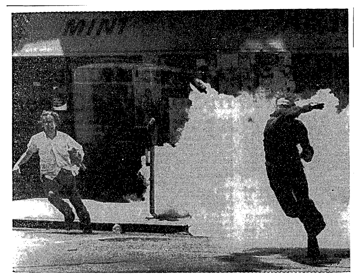
RETURNED: A demonstrator throwing a tear gas canister back at the police during yesterday's violent rioting in Berkeley, Calif., near the University of California campus.