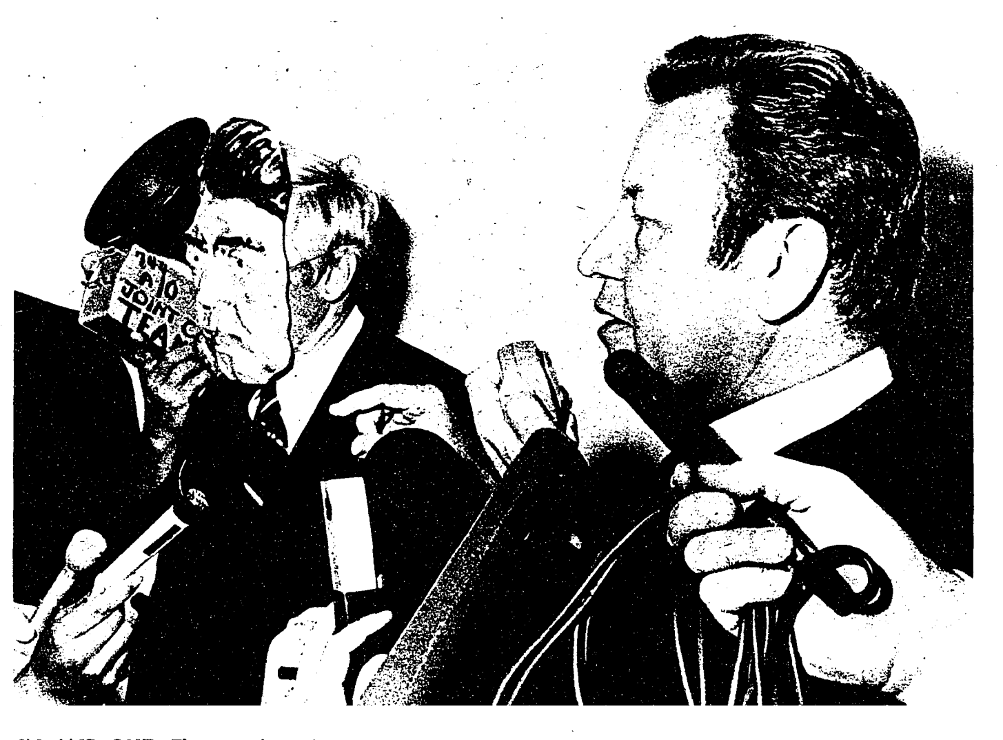
IN AND OUT: The incumbent (opposite page, at a news conference) has based his re-election campaign on attacks against welfare cheaters, campus unrest and the high cost of government. His opponent, Jess Unruh, the former Speaker of the State Legislature (above, with an aide wearing a Ronald Reagan mask), is counting on inflation and rising unemployment to turn California voters against the Republicans. Says one Democrat: "It's just a question of which fears you play on."