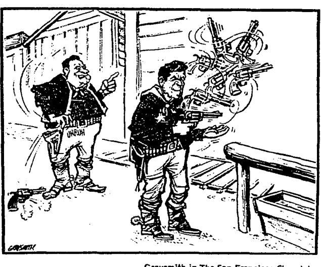
Graysmith in The San Francisco Chronicle. "I've come for you, Ronnie."

The best example of switching signals because of the tracking surveys was the conservation issue. Last year voters started identifying the environment as a major concern, and Reagan jumped on