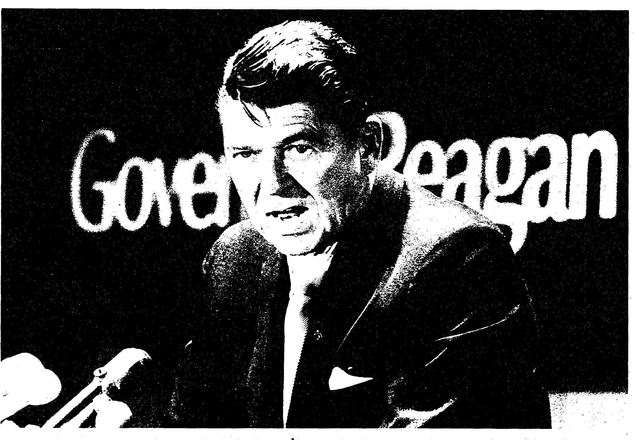
Reproduced with permission of the copyright owner. Further reproduction prohibited without permission.